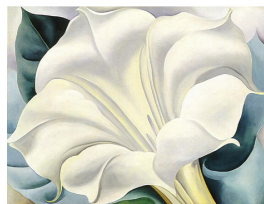
Georgia O'Keefe 1887–1986