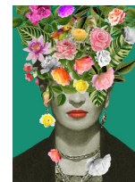
Frida Kahlo 1907–1954